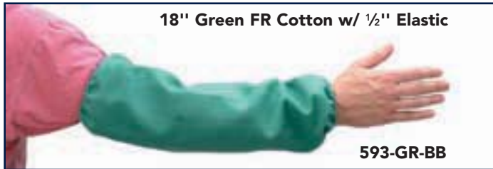
18" Green FR Cotton w/ 1/2" Elastic