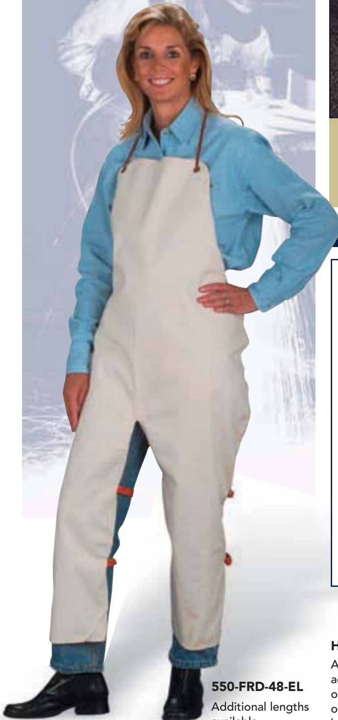
550-FRD-48-EL Additional lengths available

Our split leg aprons, chaps and hip leggings are available in a variety of styles, lengths and fabrics. see page 27 for many of our most popular styles. Please specify or call us if you require unique closures or features.