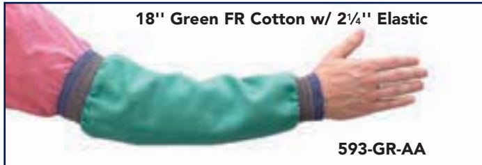
18" Green FR Cotton w/ 2 1/4" Elastic