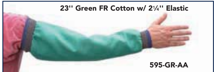
23" Green FR Cotton w/ 2 1/4" Elastic