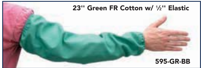
23" Green FR Cotton w/ 1/2" Elastic